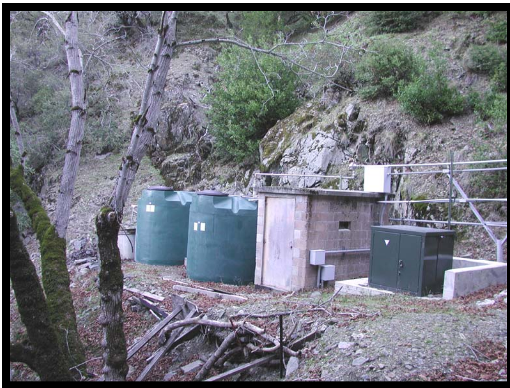
North Spring Storage Tanks